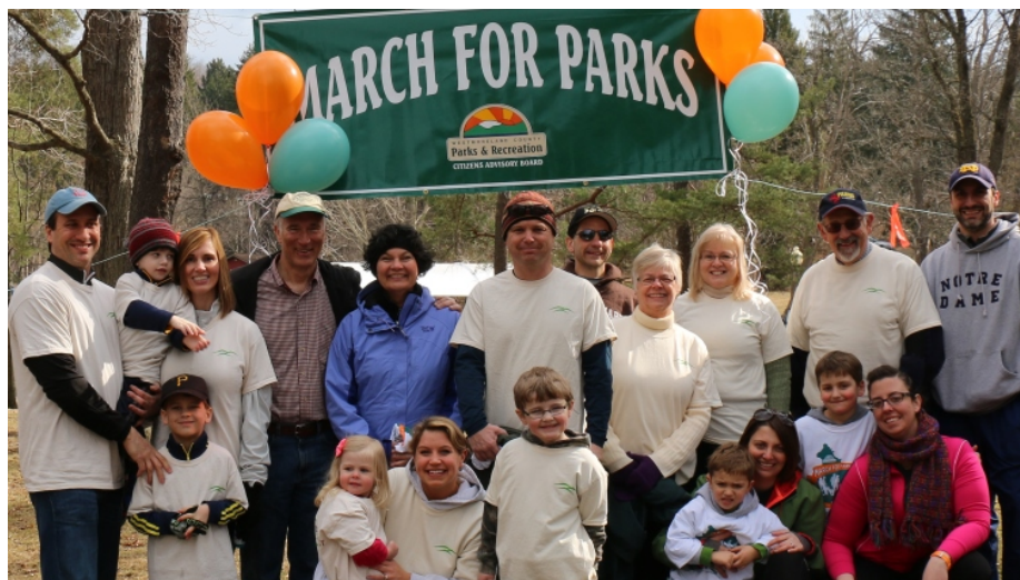
The Westmoreland Land Trust Team at Twin Lakes. The Trust also had a team at the Murrysville march location.