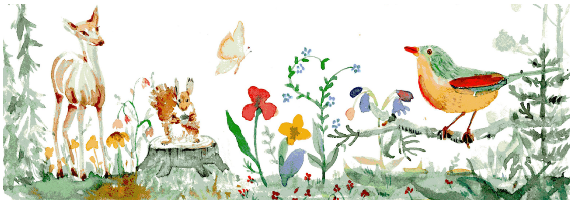
Image by Anna Alam from calligraphy thanking the Sisters of Mercy for conservation of St. Xavier

The Westmoreland Land Trust is a 501(c)(3) charitable organization. Contributions to the trust are tax-deductible under the provisions of the Internal Revenue Code to the extent of the law.